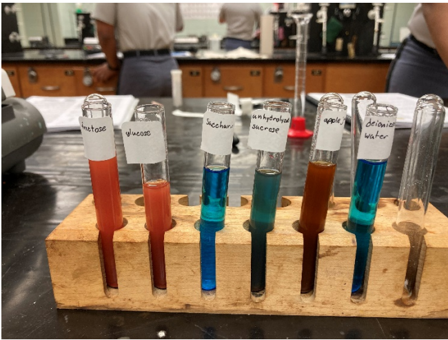
TT #2, #3, #4, #5, #6, #7